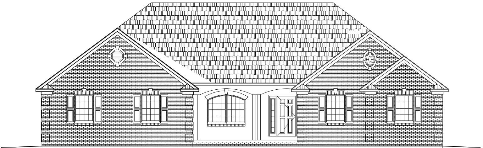
FRONT ELEVATION A-1